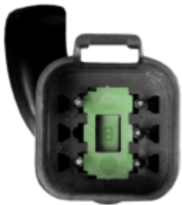
Pigtail Deutsch 6-pin