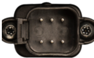
Built-in Deutsch 6-pin