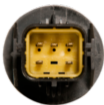
Built-in AMP 6-pin