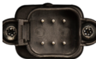
Built-in Deutsch 6-pin